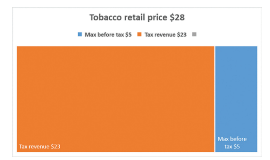
Figure 2: Example of maximum pack price before tax $5, mandated pack retail price $28 ($23 tax)

'Maximum price before tax' systems are widely used when there are private monopolies or restricted markets, as a way to protect communities. For instance, with power, fuel, communications or other networks.[96 97] This system would also be suitable for the commercial sale of an addictive dangerous product.