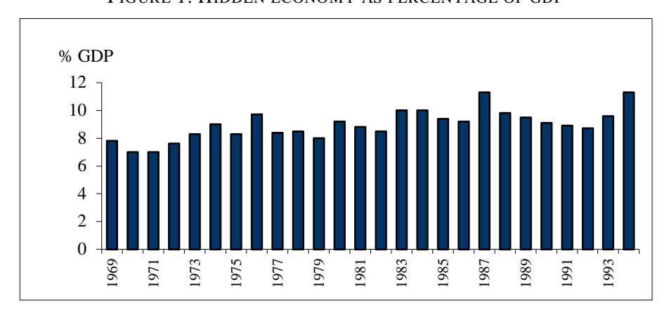
FIGURE 1: HIDDEN ECONOMY AS PERCENTAGE OF GDP